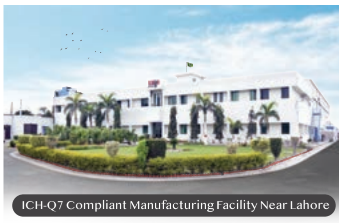
ICH-Q7 Compliant Manufacturing Facility Near Lahore

Microencapsulation is the process by which small particles or droplets are surrounded by a coating to produce capsules for the purpose of shielding the API or excipient from the surrounding environment in the micrometer to millimeter range. At Surge, microencapsulation of APIs and excipients is carried out at all levels; from laboratory scale to bulk scale on latest European equipment.